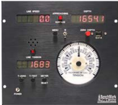
50 Series Display Panel