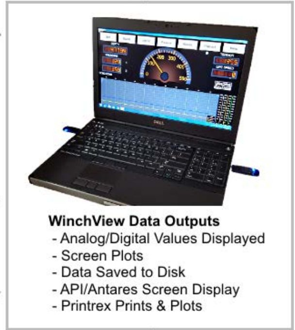
WinchView Data Outputs