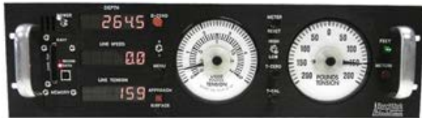
60 Series Display Panel