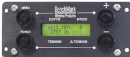
603/606 Waterproof Display Panel